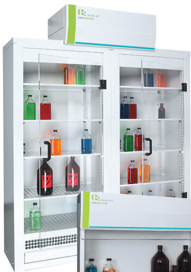
844 Maxi chemical storage cabinet

THE EFFECTIVE WAY TO ELIMINATE AIRBORNE RISKS AND TO PURIFY LABORATORY AIR