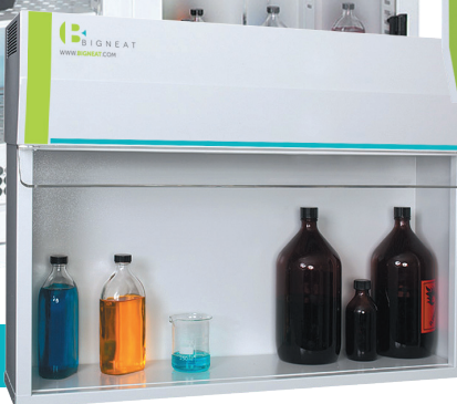
812 Shelf store