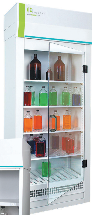
834 Chemical storage cabinet