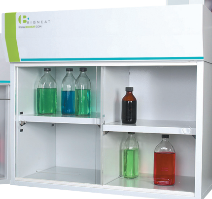
822 Shelf store