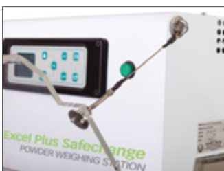
Door open stay

Cabinet incorporates a 'True Safechange' mechanism that enables the safe removal of HEPA particulate filters. Replacement is performed under negative pressure with the cabinet running. This is an alternative to a bag-in/bag-out system.