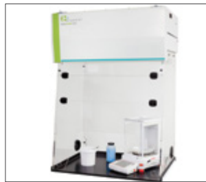
XIT Plus Larger cabinets, with more features