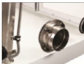
Waste bag port