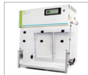
EXCEL Plus Safechange Cabinets for the most hazardous powders

Energy efficient fan system incorporating H14 or U15 particulate filtration