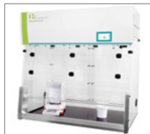
EXCEL Plus For more demanding weighing applications, turbulent free air flow