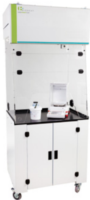
XIT Plus on optional stand

NB: Black is ideal for highlighting powder spillages.