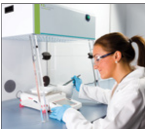
F3-XIT Small footprint weighing cabinets