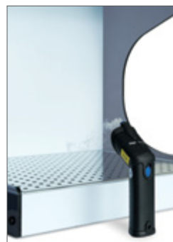
Flow demonstrated with a Dräger Flow Check.