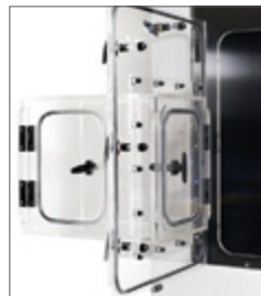
Air lock transfer hatch