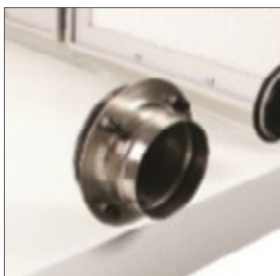
Handling systems for waste