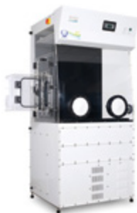
Controlled Environment Chamber | T°/RH