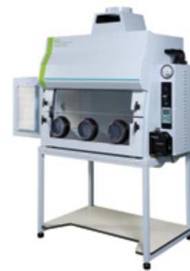
Isolator | Grade A Class III