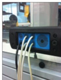
Rextec sealed cable glands