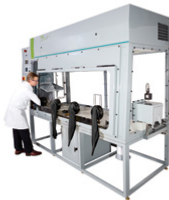
Controlled Environment Chamber T°/RH | Hypoxic | Anaerobic Optional Sterile Air