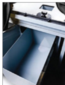
Ventilated waste tips and plates container