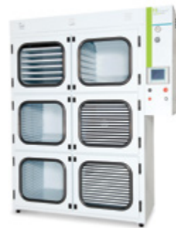
Controlled atmosphere storage system with dry N 2 ideal for a Compound Library.