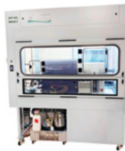
Flow Cytometry B2 Type Enclosures