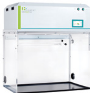
ISO 5 - Class 100 Clean Air Systems / Sterile Systems