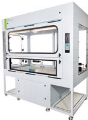
Chemicals & Solvents Cabinets & Enclosures Class I User Protection