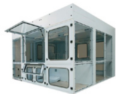
Custom Walk-In Class II Enclosures