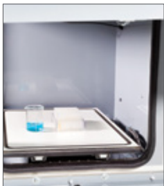
Various handling systems for loading