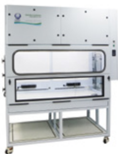
Biological Class II A2 & B2 Type Enclosures