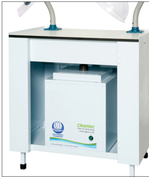
Mini Cleantec 200 connected to 50mm arm located through work surface