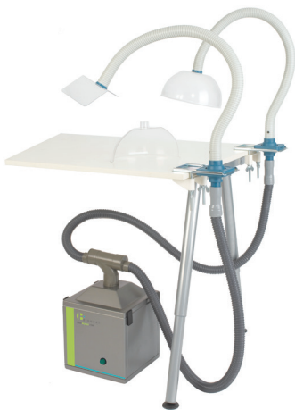
Mini Cleantec 100 — Example configuration using 2x32mm flexible arms with optional domed and clear flanged hoods, semi-permanent fixture to bench

Bigneat Mini Cleantec systems are designed to solve your fume, dust and odour problems at the press of a switch. Local extraction and filtration efficiently removes low volumes of hazardous materials at source; the systems are easily installed and can be readily moved.