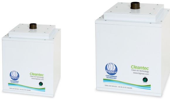
Mini Cleantec 100 (left) and 200 side by side