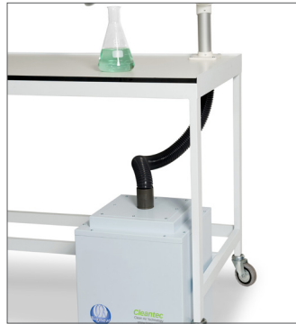
Mini Cleantec 200 extracting from fume cabinet enclosure