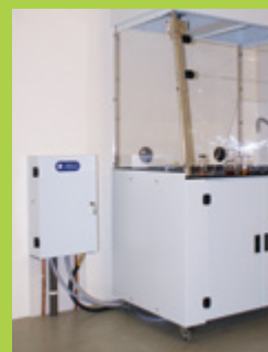
EDU Chemcap with Secure Docking Hub

Bigneat is committed to your safety and will advise on the suitability of EDU Chemcap Ductless Fume Cabinet for your applications. We will make suggestions as to good working practices and how best to maintain the safety and wellbeing of your staff and students using our cabinets.