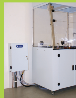
EDU Chemcap with Secure Docking Hub

Bigneat is committed to your safety and will advise on the suitability of EDU Chemcap Ductless Fume Cabinet for your applications. We will make suggestions as to good working practices and how best to maintain the safety and wellbeing of your staff and students using our cabinets.