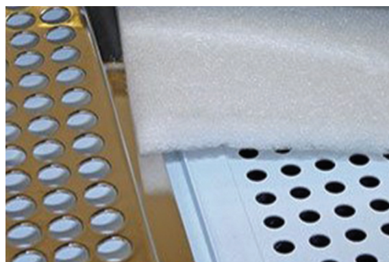
Picture shows quality of airflow grilles, work surface and pre-filter pad.

The Bigneat design for this downflow bench provides a robust stainless steel work area surrounded by an extraction grille. This gives the user a firm flat surface on which to safely work.