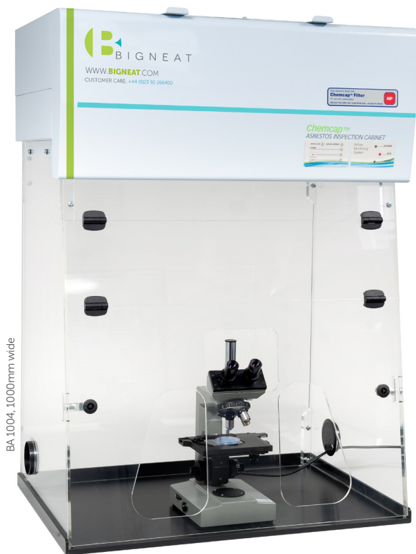
BA 1004, 1000mm wide