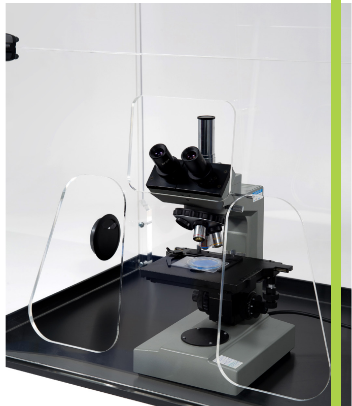
Detail of acrylic, showing services port in side panel.