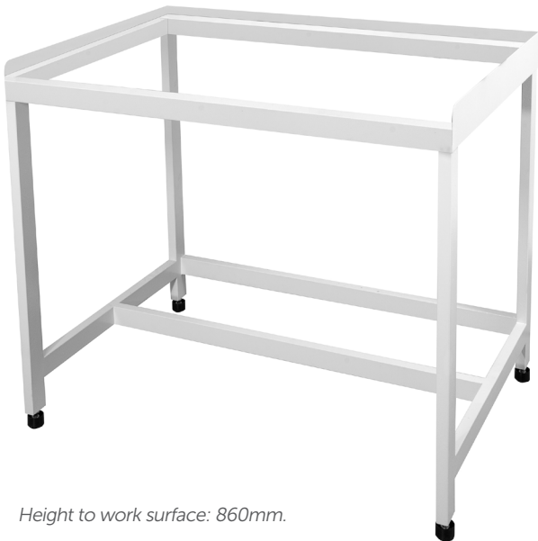
Height to work surface: 860mm.

To make your cabinet free standing, you may choose to purchase an open box section support stand with adjustable/levelling feet. A motorised height adjustable version is available.